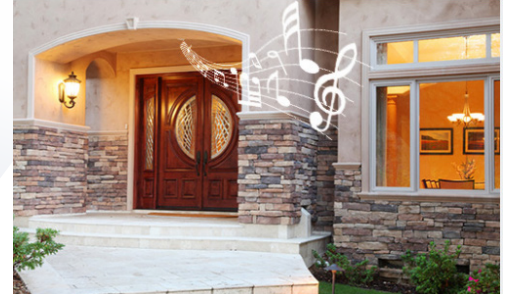
Enhanced Control & Integration