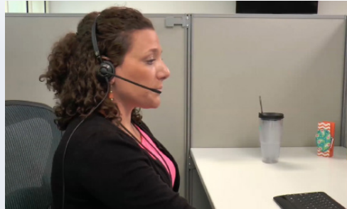
Professional Video Monitoring