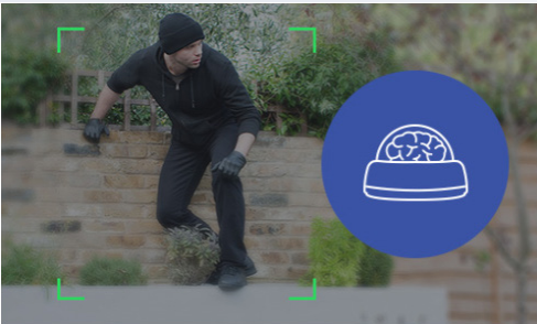
Embedded Intelligent Analytics