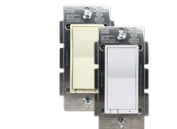
In-Wall Dimmer CLR-CVL-IWD-10