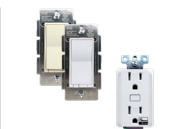
In-Wall Fan Control CLR-CVL-IWF-10