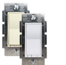
In-Wall Switch CLR-CVL-IWS-10