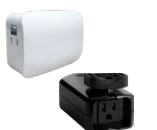
Plug-In Dimmer CLR-CVL-PLD-10