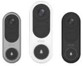
ClareVision Smart Video Doorbell CLR-V200-VDB