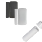
Mini Door/Window Sensor CLR-C1-DW-W, CLR-C1-DW-B