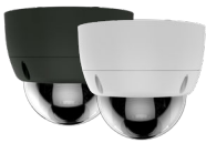
4MP Dome, Starvis™, Motorized Varifocal CLR-V200-4DVF(W/B)