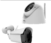
4MP Wi-Fi Turret, 3.6mm, 32GB CLR-V100-4T36WF-W