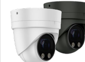
4MP Turret, Starvis™, Motorized Varifocal CLR-V200-4TVF(W/B)