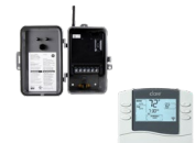
Outdoor 40 Amp Switch CLR-CVL-OSS-DW40