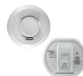
Smoke and Heat Detector CLR-C1-SMK