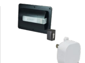
Linear Z-Wave Garage Door Module CLR-GD00Z