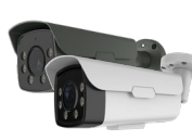
4MP Bullet, Starvis™, Motorized Varifocal CLR-V200-4BVF(W/B)