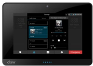
ClareOne Wireless Security and Smart Home Panel CLR-C1-PNL1 (Verizon) CLR-C1-PNL1A (AT&T & Rogers)