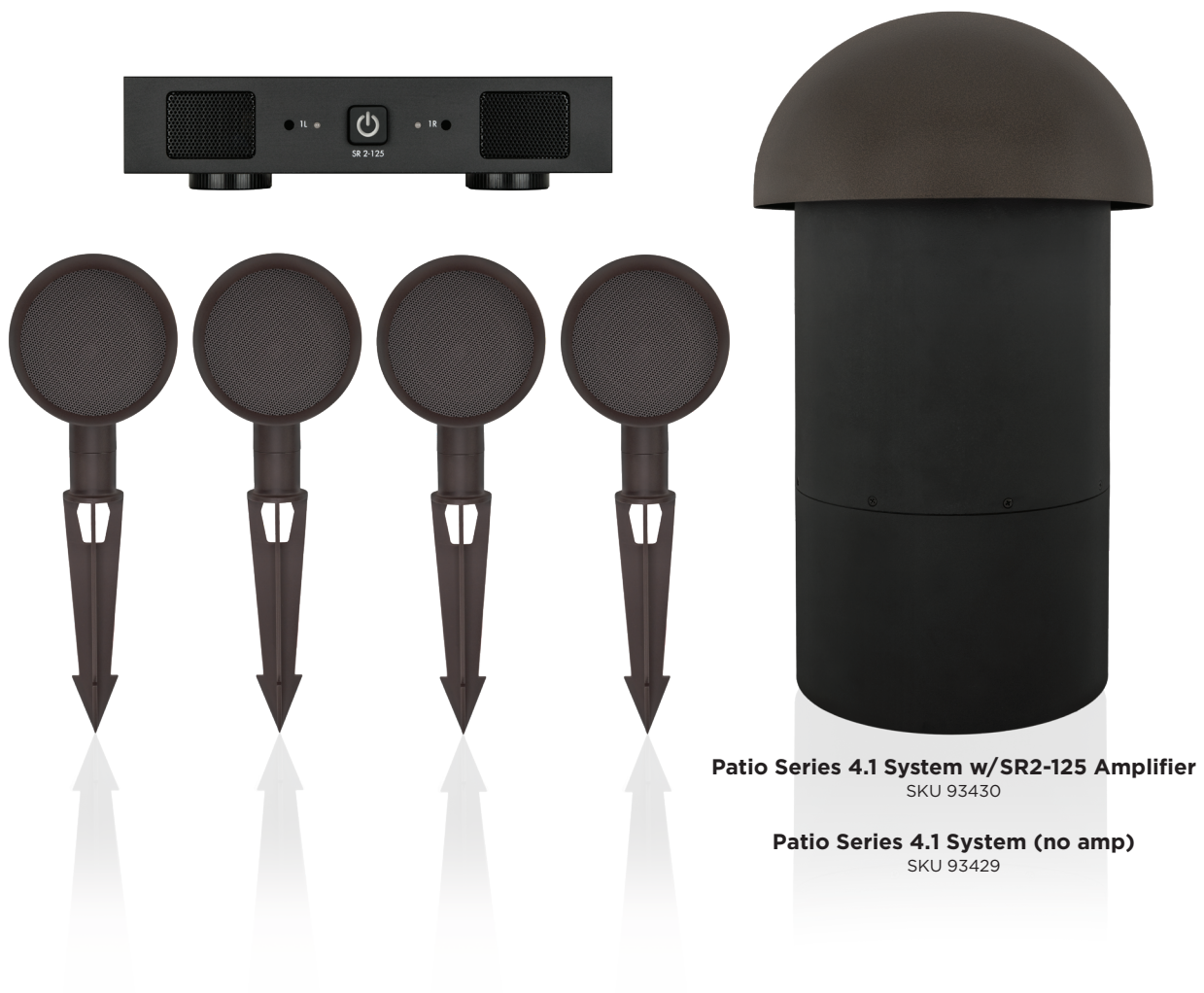
Patio Series 4.1 System w/SR2-125 Amplifier SKU 93430