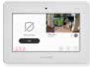
ProSeries A7 PLUS