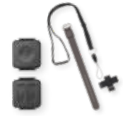
Medical and Panic Transmitters