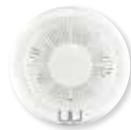
Combination Smoke/CO Detector