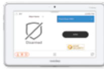
7" Touchscreen Display (Wireless)