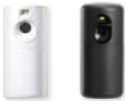
Indoor /Outdoor MotionViewer