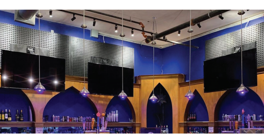
MantelMount. MM700 U.S. PATENT NO. 8,864092