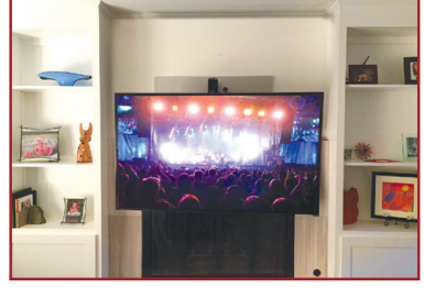
Perfected View with the MantelMount 540