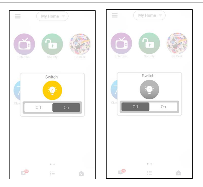
Figure 1: Switch on and off

Note: Accessory devices do not have individual UI services. To use accessory devices from the app, control them through their associated master device.