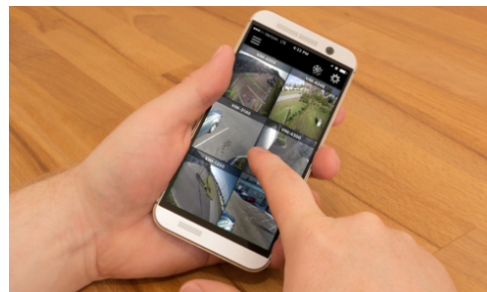
Intuitive Mobile App