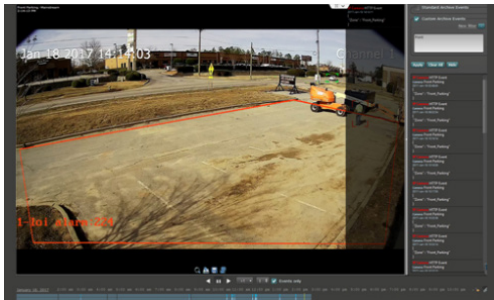
User-Friendly Observer UI