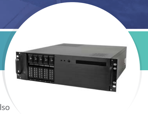
Network Video Recorder

Enjoy all the best features of the Line Series, plus enterprise-grade storage and comprehensive control system integration. With a speedy Intel i7 processor and up to 48TB of additional hard drive space, this video management system is ideal for commercial locations or custom security systems. The Line HC series is also compatible with a range of hardware to suit your unique needs.