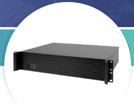
Network Video Recorder

Our Line Series recorder offers a full video management system (VMS), a user-friendly interface, a smart search function, and Visualint viewer software. Plus, you can customize the number of channels you want to fit your location. It even supports over 4000 IP cameras from ONVIF-certified manufacturers.