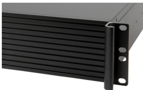
Clean, Finished Look