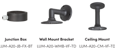
Junction Box LUM-A20-JB-FX-BT Wall Mount Bracket LUM-A20-WMB-VF-TD Ceiling Mount LUM-A20-CM-VF-TD