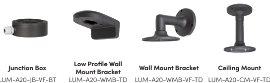
Junction Box LUM-A20-JB-VF-BT Low Profile Wall Mount Bracket LUM-A20-WMB-TD Wall Mount Bracket LUM-A20-WMB-VF-TD Ceiling Mount LUM-A20-CM-VF-TD