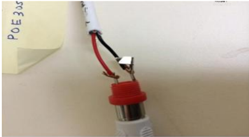
Image 2: This is the connector that goes to the camera, plug the wires in as if you were looking straight down at the camera so the cables are on the left side). First the Red (Input) goes in, then the Black (Common) is connected together with the Green (common) from the amplifier. The Green (common) and White (output). Then that gets plugged into the camera.

Image 1: This is the microphone connector. In this picture, Black is common and Red is input.