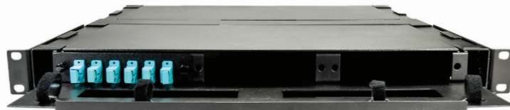
Enclosure shown with partial installation. Enclosures are sold empty.

The SSF-1RU-E3 is a 1RU fiber distribution panel that can accept up to 3 SSF™ Adapter Plates. The enclosure includes a slide out master panel that allows for easy access of terminations, fiber management and splicing. The unit includes two-position rack mount ears and features an easily removable cover without screws.